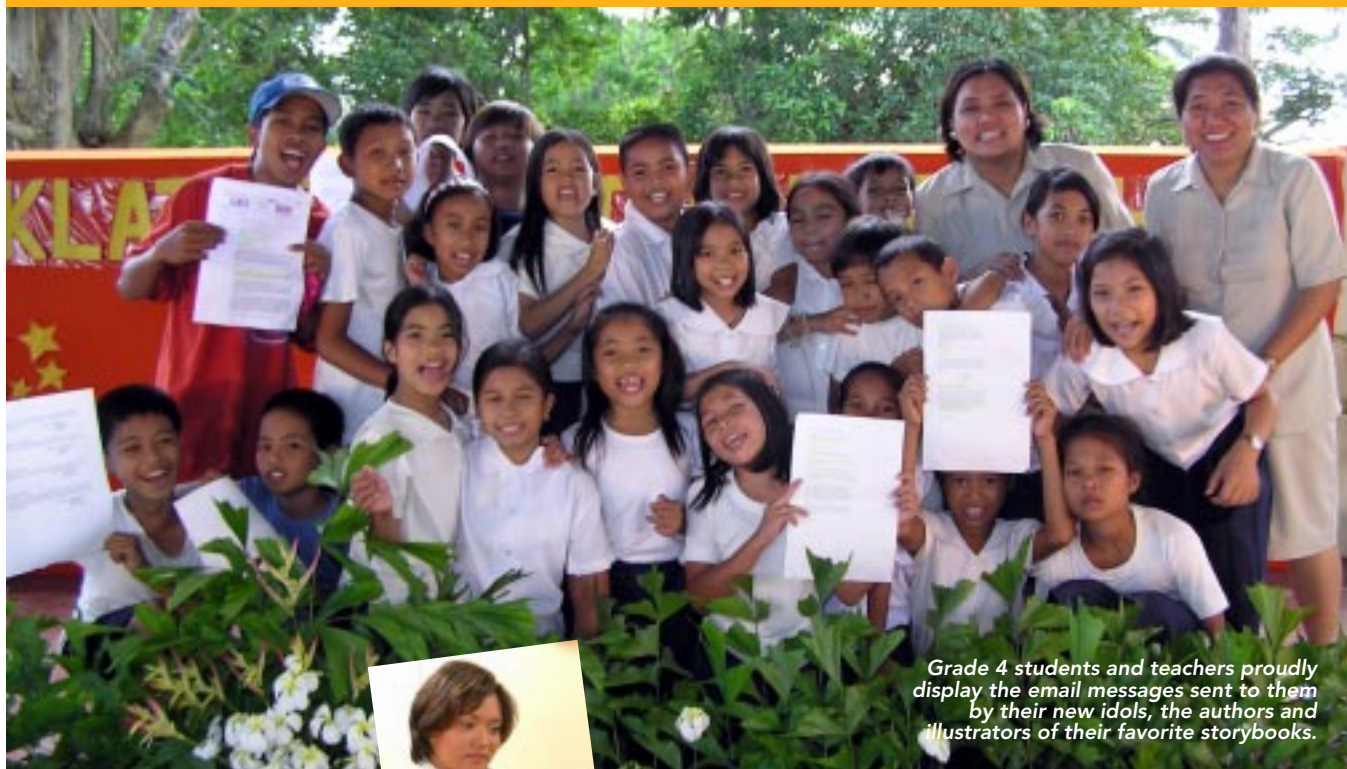
Grade 4 students and teachers proudly display the email messages sent to them by their new idols, the authors and illustrators of their favorite storybooks.

How a motivated teacher got her kids excited about the books they were reading.